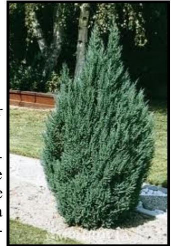
Blue point Juniper