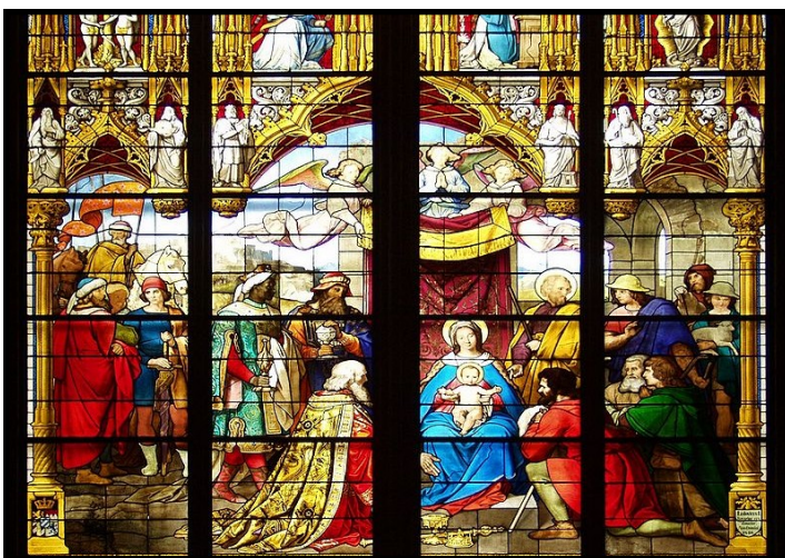
Cologne Cathedral - Windows "Bayernfenster" - Three Wise Men

Throughout this joyful season, O Lord, as we gather together, unite our hearts with the warm glow of love and our voices in the bright gladness of song. Bless all whose lives are closely linked with ours, and grant that we may serve Christ in them and love one another as He loves us. Bless this meal that we now receive to sustain us as we seek to love and serve through Christ our Lord. Amen.