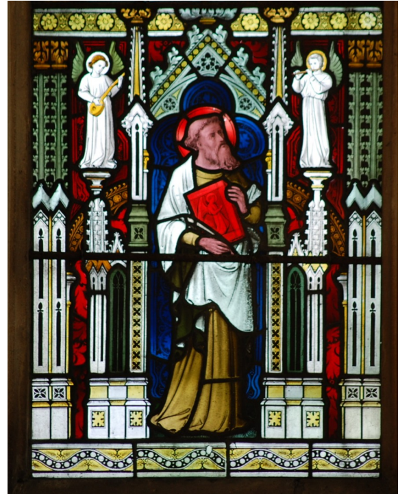
Church of St. Mary & St. Lambert, Stonham Aspal, Suffolk

Who am I? [find the answer in the birthday list.]